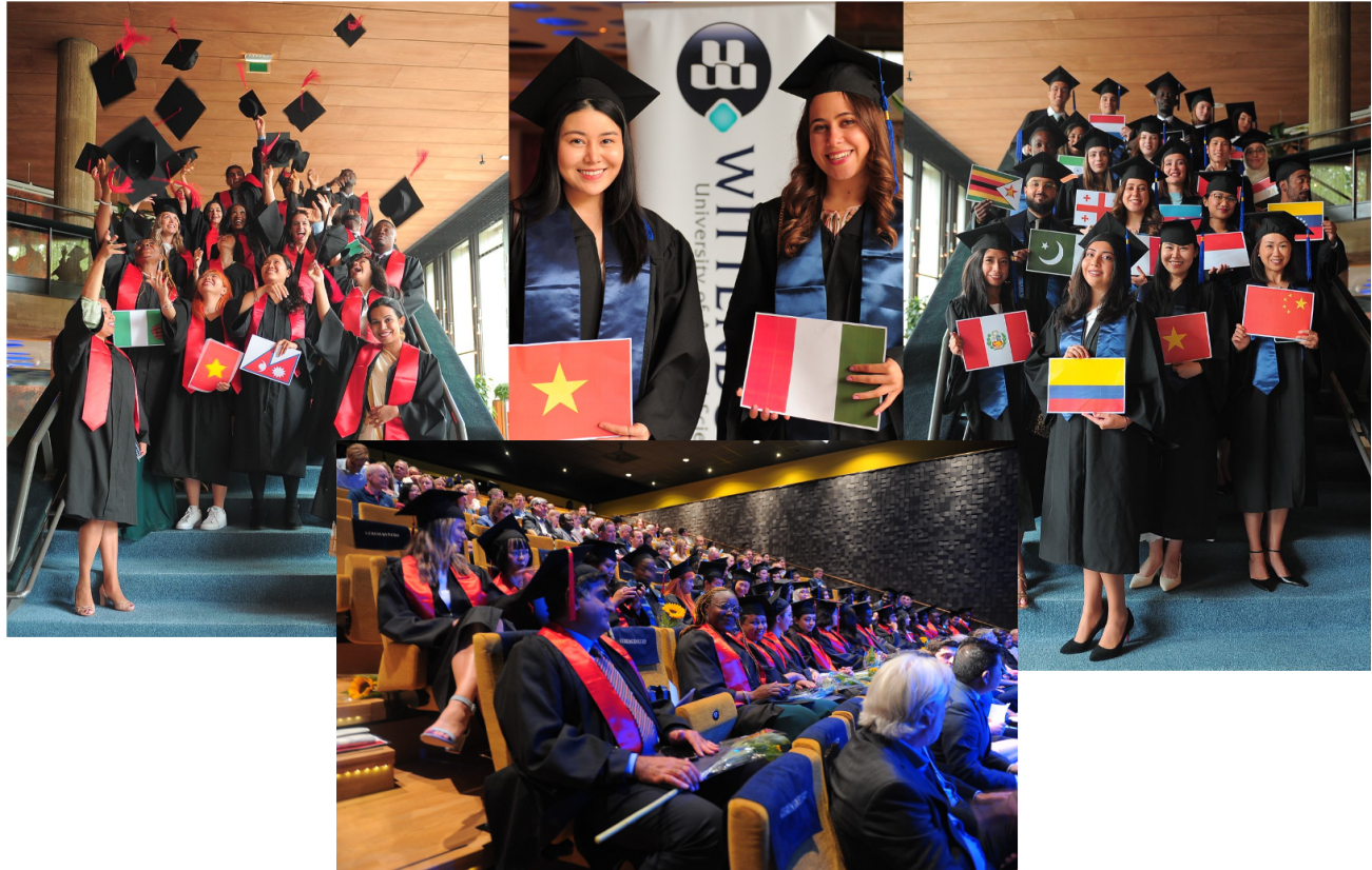
(Above: Bachelor & Master Graduation. At the Orpheus Theatre Apeldoorn)

That leaves me and our wonderful team at Wittenborg only to wish you all an enjoyable and productive study time with us!