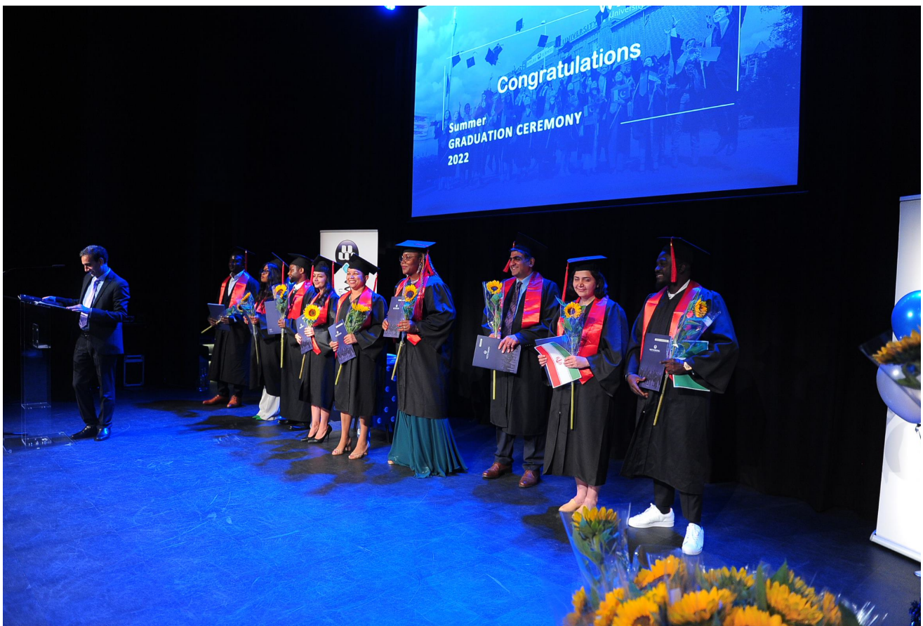
(Above: Graduates 8 July 2022, at the Apeldoorn Municipal Theatre Orpheus)